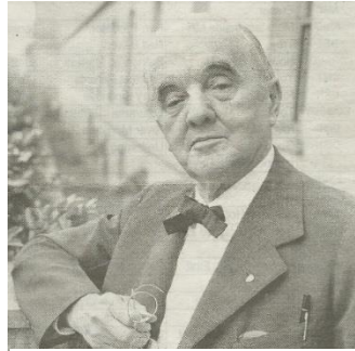
Senator Norris. Pftd.

"Menominee commitments in World War II" by Jerry Chappell, March 10, 2011.